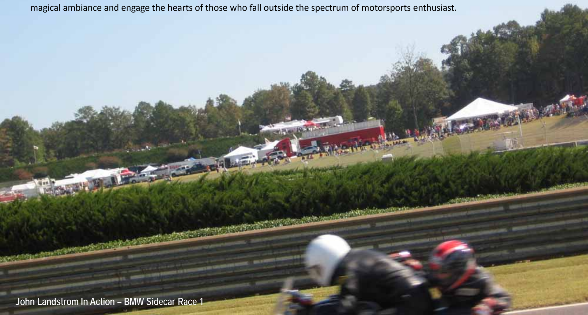
John Landstrom In Action – BMW Sidecar Race 1

A trip to Barber Motorsports Park is always a special treat. Nestled between the Talladega National Forest and Birmingham, Alabama, one can't help but be stricken by the beautiful rolling landscape offering sun-drenched grassy slopes and tree-lined hillsides. The footpath connecting the famed Barber Vintage Motorsports Museum and shaded spectator areas for the back side of the zig-zagging 2.38 mile roadrace course is speckled with surprises that give one pause to realize they are in an exceptional place. Botanical imprinted walking stones and views of giant steel insects marching on the infield convey a Disney-like magical ambiance and engage the hearts of those who fall outside the spectrum of motorsports enthusiast.