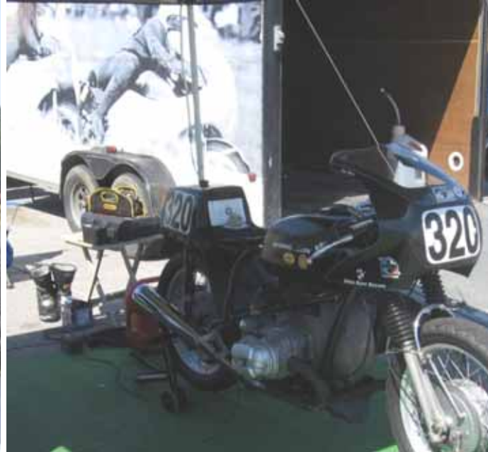
#320 BMW 75/5 Stan Miller